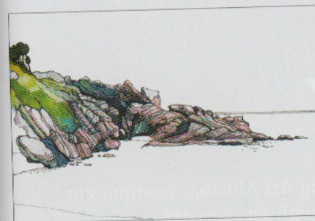
Still, 2017, ink and watercolour on paper, 30 x 42cm